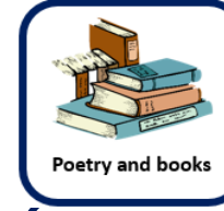
Poetry and books