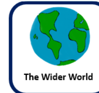
The Wider World