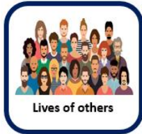
Lives of others